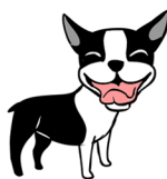
HAPPY (or hot) biłhózhq'