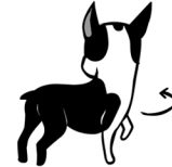
"RESPECT" (turn and walk away) shilíilí