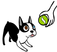
"YOU WILL FEED ME" shá'diiltsoot