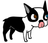
STRESSED (nose lick) i'diil'á