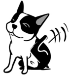
STRESSED (scratching) i'diil'á