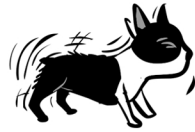
STRESS RELEASE (shake off) i'diil'á