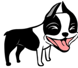
STRESSED (yawn) i'diil'á