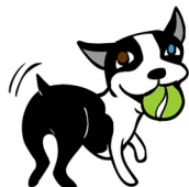
OVERJOY (wiggly) biłhózhq'