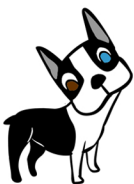
CURIOUS (head tilt) HAAILAH