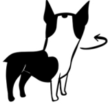
"PEACE" (look away/head turn) hodézyéé