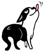
FRIENDLY & POLITE (curved body) bááhwiinít'íí