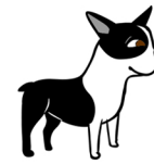
RELAXED (soft ears, blinky eyes) hodézyéé