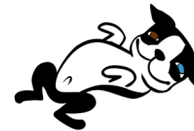
"I'M YOUR PET/DOG" ni lééchaq'j nishlj